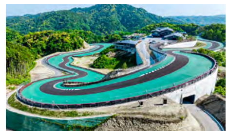
The ultra-exclusive Magarigawa Club racing track

The six-day motoring experience across Japan's main island of Honshu will commence in Tokyo. Participants will embark on a journey to the East, North and West of the region. Participants will discover unique facets of Japanese culture and be treated to the tastes, sights and sounds of Honshu, including spectacular views of Mount Fuji, scenic coastlines, and mountain roads, before the culmination at the ultra-exclusive Magarigawa Club racing track.